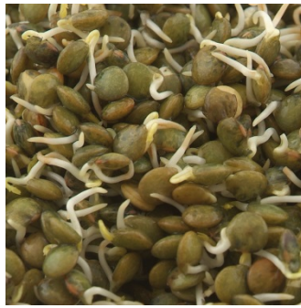
Sprouts / 3 days