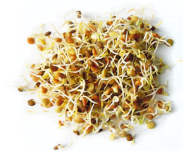
Sprouts / 6 days