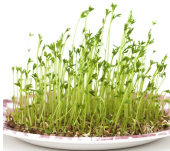
Microgreens / 6 days