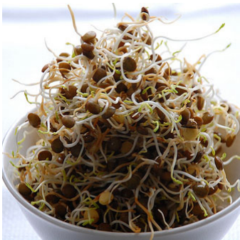
Sprouts / 8 days