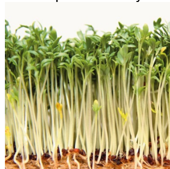
Microgreens / 10 days

Taste Taste, more or less pronounced depending on the species, slightly sweet with a hazelnut-like smell reminding of the white bean. Coral colored lentils generally have a more delicate flavor.