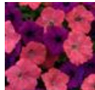
Opposites Attract Mixture