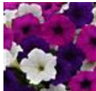
Great Lakes Mixture