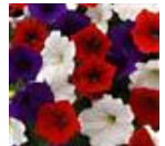
The Flag Mixture